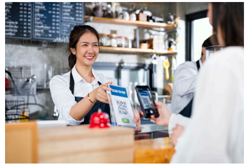
Point of Sale