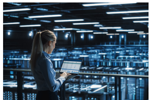
Micro Data Center & Server Room