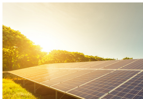
Power & Energy Management